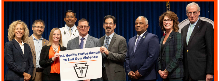
The coalition launches on Oct 8th with a series of press events featuring doctors, nurses, and other public health leaders in Philadelphia (top), Pittsburgh (middle), and at the Capitol in Harrisburg (bottom)